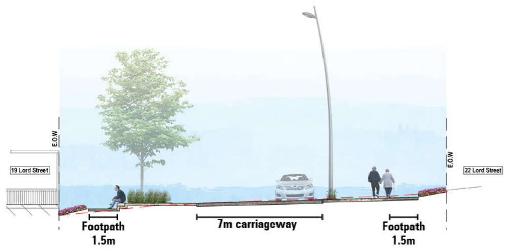
Section B-B 1:200@A3